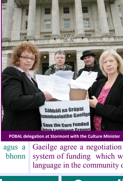
Gaeilge agree a negotiation mechanism with us, to come up with a new system of funding which will support and encourage the use of the Irish language in the community on an agreed and planned basis.