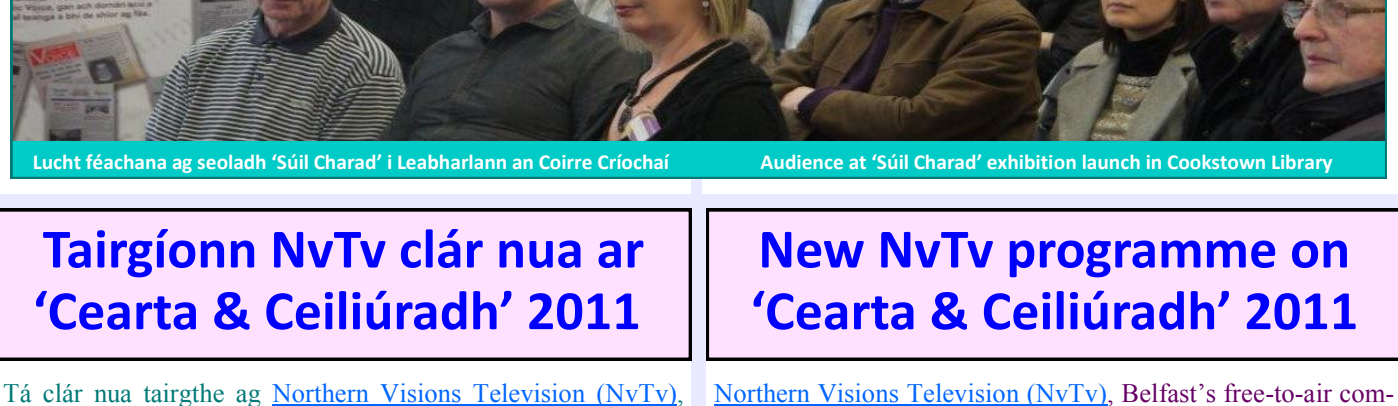
Lucht fáchána ag seoladh 'Súil Charad' i Leabharlann an Coirre Cricóich Audience at 'Súil Charad' exhibition launch in Cookstown Library

Download a copy of the 'Súil Charad' exhibition booklet