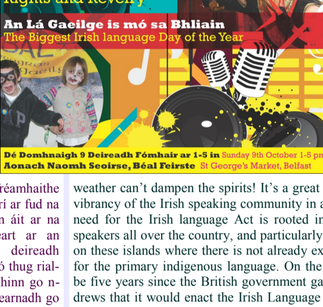
Dé Domhnaigh 9 Deireadh Fómhair ar 1-5 in Sunday 9th October 1-5 pm Aonach Naomh Seoirse, Béal Feirste St George's Market, Belfast