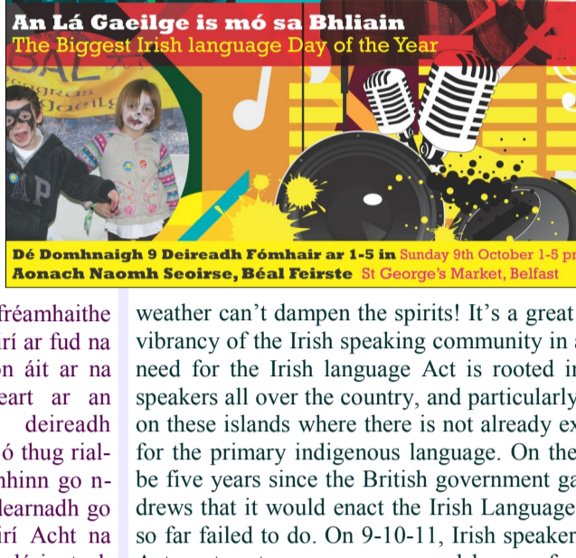
Dé Domhnaigh 9 Deireadh Fómhair ar 1-5 in Sunday 9th October 1-5 pm Aonach Naomh Seoirse, Béal Feirste St George's Market, Belfast